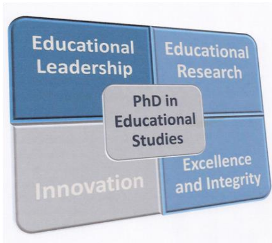
Figure 1 — PhD Program Objectives

The Inter-University Doctoral Program in Educational Studies has four overarching objectives: