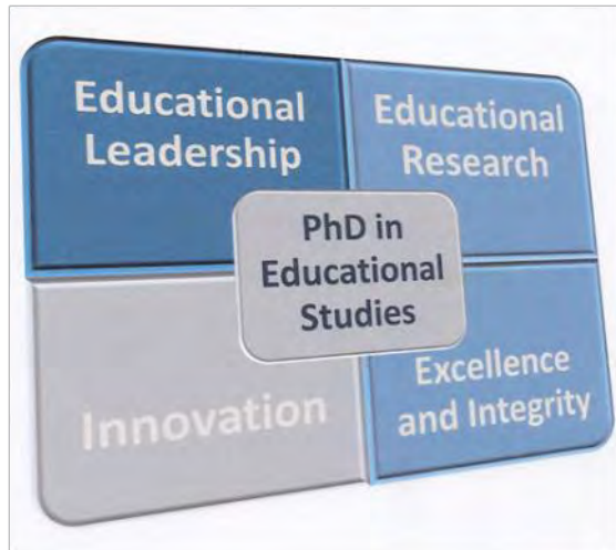
Figure 1 — PhD Program Objectives

The Inter-University Doctoral Program in Educational Studies has four overarching objectives: