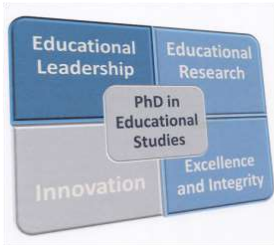
Figure 1 — PhD Program Objectives

The Inter-University Doctoral Program in Educational Studies has four overarching objectives: